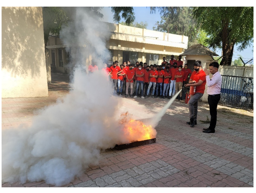
Fire safety Training