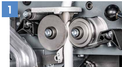
The new measuring system