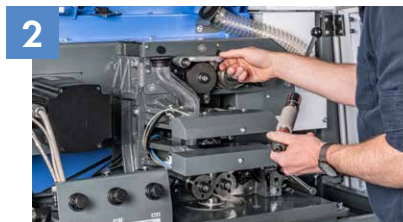
Easy access to every part