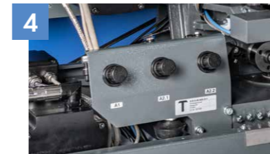
New top roller pressure monitoring