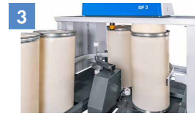
Can changer becomes a game-changer