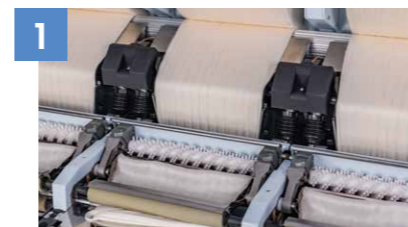
12 heads for lowest conversion

The new Trützschler heavy-duty comber maximizes productivity by 50 % and saves 25 % space – without compromising on quality.