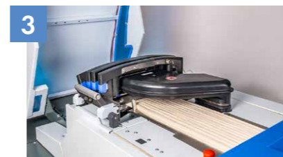
Superior quality on 12 heads